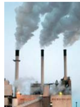
Mercury contamination is widespread globally, originating from natural and human-related sources, including air transport from coal combustion, waste incineration, and mining.

The NAWQA Program is studying mercury cycling in watersheds across the Nation to build an understanding of how natural features and human activities affect the transformation, transport, and bioaccumulation of mercury in stream ecosystems. As of August 2008, mercury was the second leading cause of stream impairment throughout the Nation ( USEPA 303(d) list ). Methylmercury is a neurotoxin that is biomagnified in aquatic food webs so that piscivorous fish and wildlife, and humans that consume fish, are potentially at greater risk of exposure to methylmercury. USGS data and research may aid in the development of more rigorous models that relate water quality to mercury bioaccumulation, thereby enhancing capabilities for predicting mercury contamination in fish.