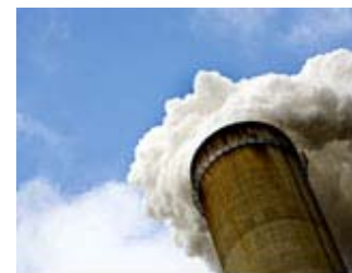
An Ohio power plant spews smoke into the air.

Some compounds can linger for decades after a single exposure. Take DDT, a pesticide that can damage the nervous system. In May 2006, the Seattle-based Toxic-Free Legacy Coalition tested Washington residents and found 80 percent had detectable levels of the chemical in their bloodstreams 34 years after it was banned in the United States.