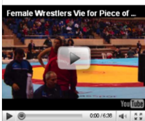
Female Wrestlers Vie for Piece of Turkey's Heart